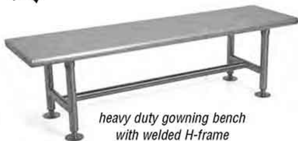
heavy duty gowning bench with welded H-frame